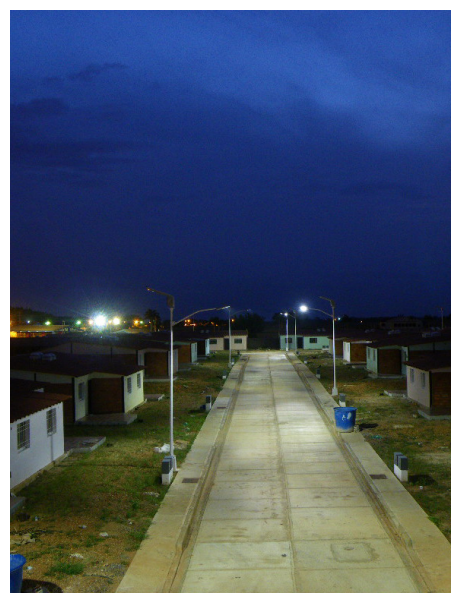
The Carmanah EverGEN 1710 units saved time and cost for PDVSA and helped them to meet the mandate for green infrastructure in the process.

For more information on: Carmanah Technologies, please visit: www.carmanah.com/lighting Iner Consultores please visit: www.inerconsultores.com