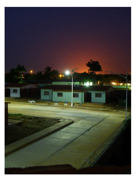
Carmanah EverGEN 1710 solar LED lighting illuminating the roadway at the PDVSA housing complex in Punta de Mata, Estado Monagas, Venezuela.

toll free: 1.877.722.8877 worldwide: 1.250.380.0052 carmanah.com